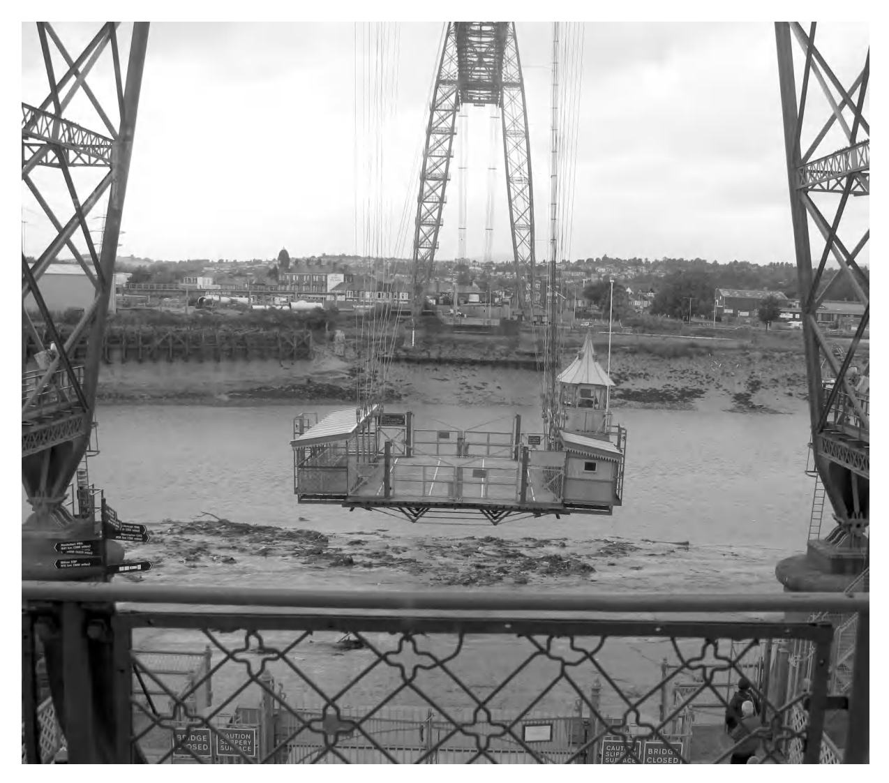
Coach Trip to Newport on 30 September 2012: Newport Transporter Bridge.

Newport. While a section of the canal arm is navigable near Crosskeys, much is still in need of restoration. Only the top lock of the Fourteen has been restored but there is still hope of further progress in the future. The locks are arranged in pairs with a very short intervening pound which connects with a large side pond. Lock 11 is still a source of conjecture over the function of the two side ledges in the lock chamber, and there was some discussion on this topic. After the walk we were able to look around the Centre with its many artefacts on view and a number of informative displays telling of general canal developments as well as the particular history of the Monmouthshire Canal and its relationship with the Brecknock and Abergavenny Canal. On the walk we also had the company of Tony Jukes (of Oxford House IHS) and back at the Centre he gave us a lot more detail of the tramroad (and later railway) developments which all contributed to the eventual decline and closure of the waterways. The top section of the main line from just north of Cwmbran to Brecon is now fully open and the two canals are known as the "Mon and Brec" but more properly as the Monmouthshire and Brecon Canals. We thanked Phil and his colleagues, and Tony, for all they had done to make our visit so interesting before boarding the coach for a smooth ride back to Barnwood.