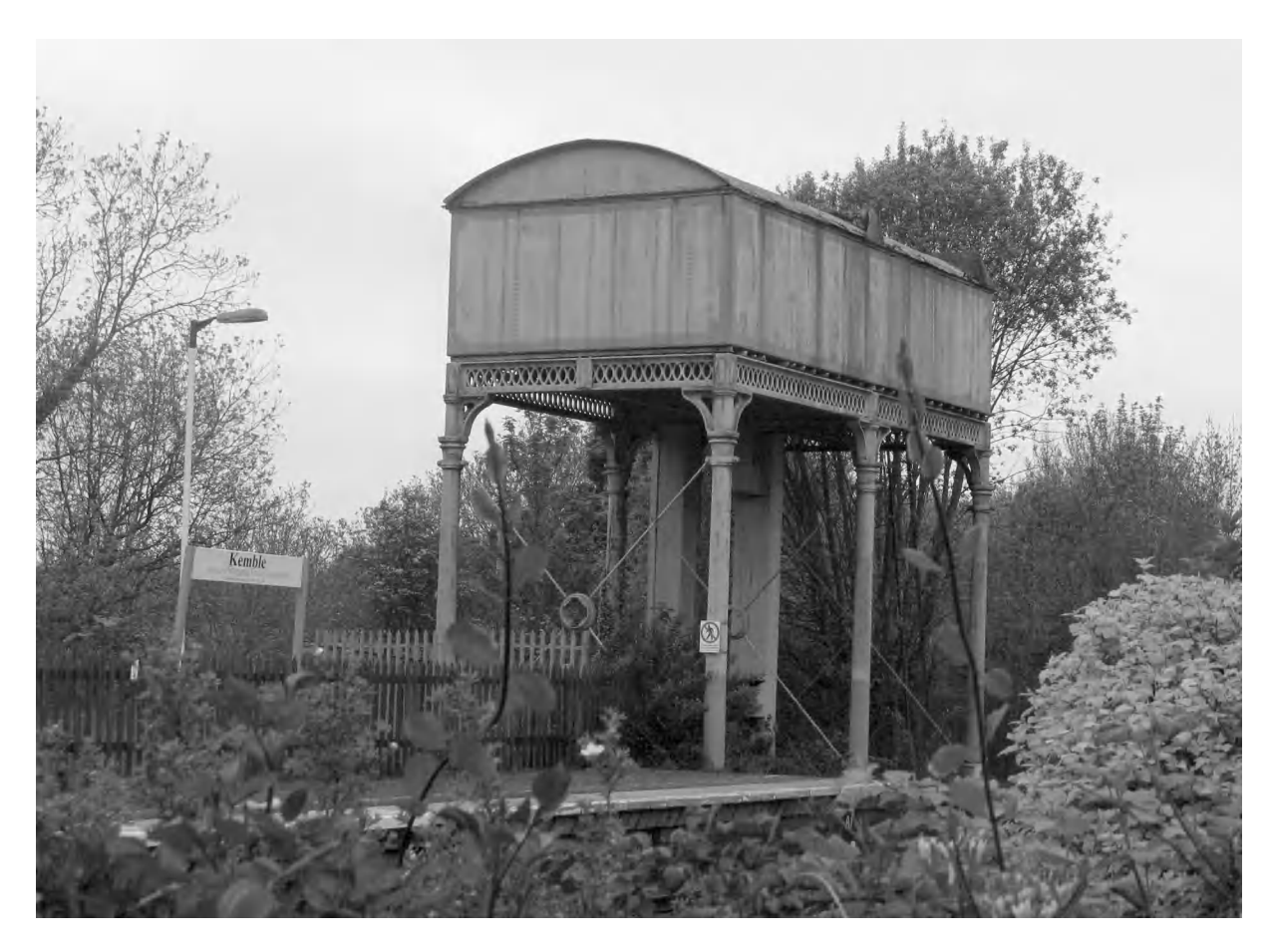
Visit to Kemble on 20 May 2012: The old GWR water tank stands at the end of the down platform. A fine relic of the days of steam.

had been completed by the GWR after purchasing the line from the Cheltenham & Great Western Union Railway in 1843. Tetbury Road had served as a passenger and goods station for Kemble itself since Robert Gordon, the local Squire, had objected to a station on his land. It was closed in 1882, when a new Kemble Station had eventually been built on the present site, but the earlier station remained in use for goods traffic and renamed as Coates in 1908. It was finally closed in 1963 and has now been demolished.