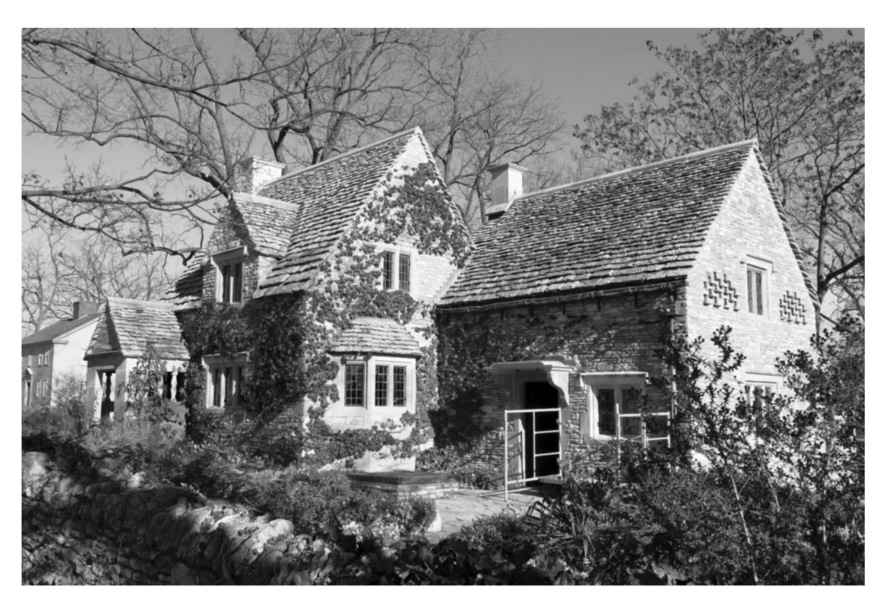
Rose Cottage at Greenfield Village in November 2010.

During his visits to England, Henry Ford always like to stay for a few days if possible in the Cotswolds, particularly at the Lygon Arms, Broadway. Impressed by the Science Museum in London, he had decided to build a museum of technology in the United States. This would house a wide range of early engineering and domestic artefacts, most of which came initially from Europe. The distinctive architectural style and attractive weathered appearance of typical Cotswold buildings appealed to him, largely because the stone walls, stone tiles and stone window mullions all blended together unbroken by other visible construction materials. Because of this, at the end of the 1920s he decided to buy an old style Cotswold house exhibiting as many local features as possible and re-erect it at what is now Greenfield Village. One requirement was that any changes which had been made must be restorable to their original state relatively easily.