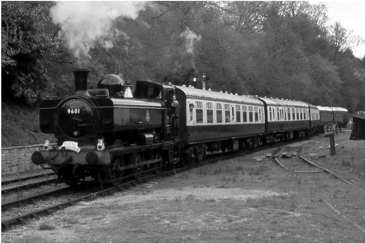
GSIA Visit to Parkend. Sunday 26 April 2009. Pannier tank engine 9681 approaching Parkend with a train from Lydney

of volunteers involved. We crossed the railway footbridge and made our way across the slope to join the Yorkley road and go into the area known as Mount Pleasant. Here we heard about some of the collieries which were worked in this area and the period when coke was made for the ironworks. We continued across a grassy area to find a prominent earthwork channel which had been the line of the leat which had brought water from Cannop Pond to drive the iron works waterwheel. To the north was a broad track which had been the line of a tramroad used for bringing coke to the furnaces and later for bringing coal from Parkend Royal colliery, up till 1928. We returned to the main road and went back to the level crossing by Parkend Station where Frank was thanked for giving us a most interesting and varied look around a fascinating area.