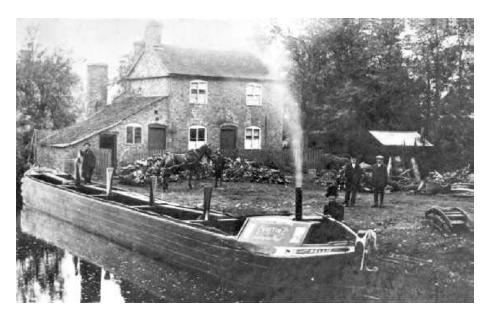
The Nellie at Eastington Wharf

Although the primary role of the canal was to carry commercial cargoes, in the past it has also been a valued area for recreation activities. The canal and towpath have been used for boating, fishing, walking, and nature study, and these will be become more important when the canal is restored. There were formerly several public houses beside the canal, and no doubt there will again be one or two in the future.