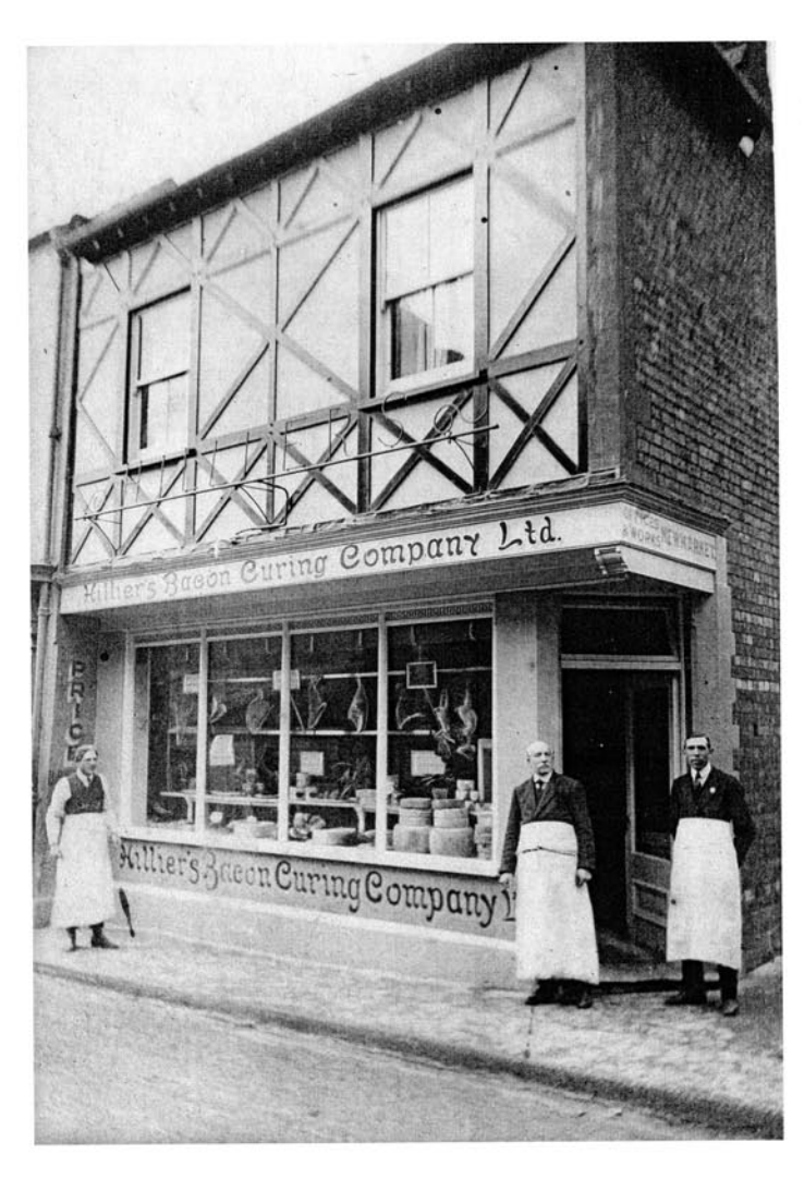
Fig. 4 c.1920-30's Hilliers shop in Market Street Nailsworth