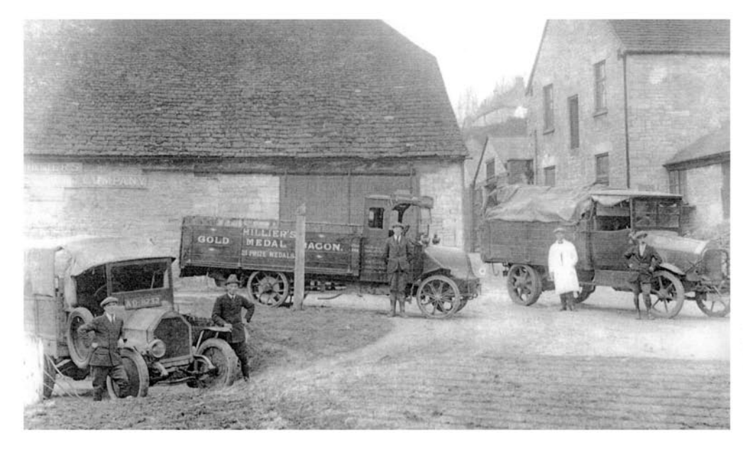
Fig. 3 1920's Delivery lorries