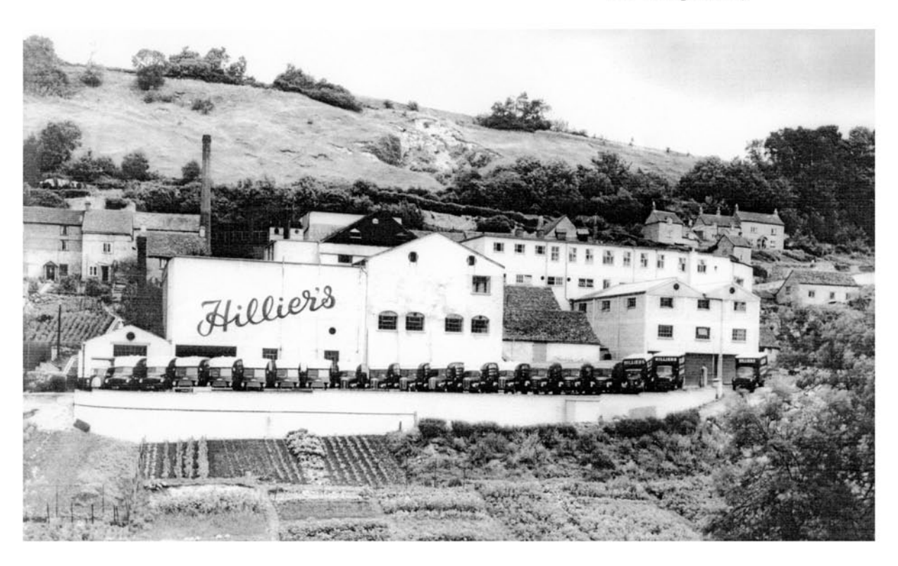
Fig. 5 1963 View of the Factory (Note the delivery vans and the workers allotments in the foreground)