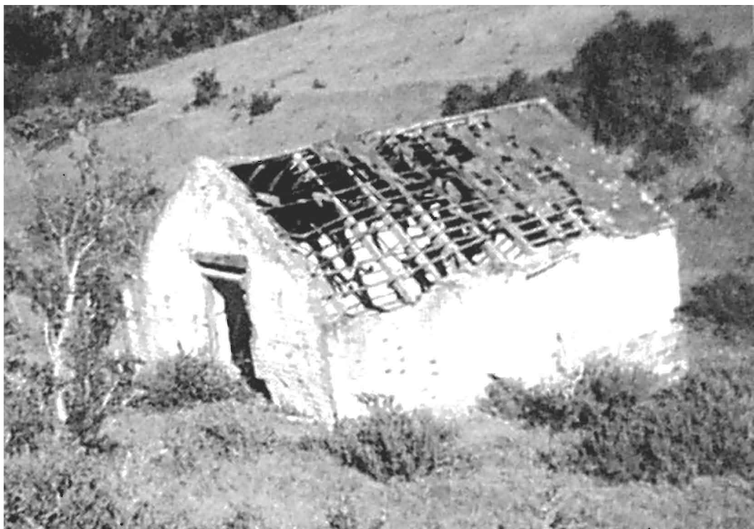
Figure 2. Bradshaw Mill in ruins c.1955