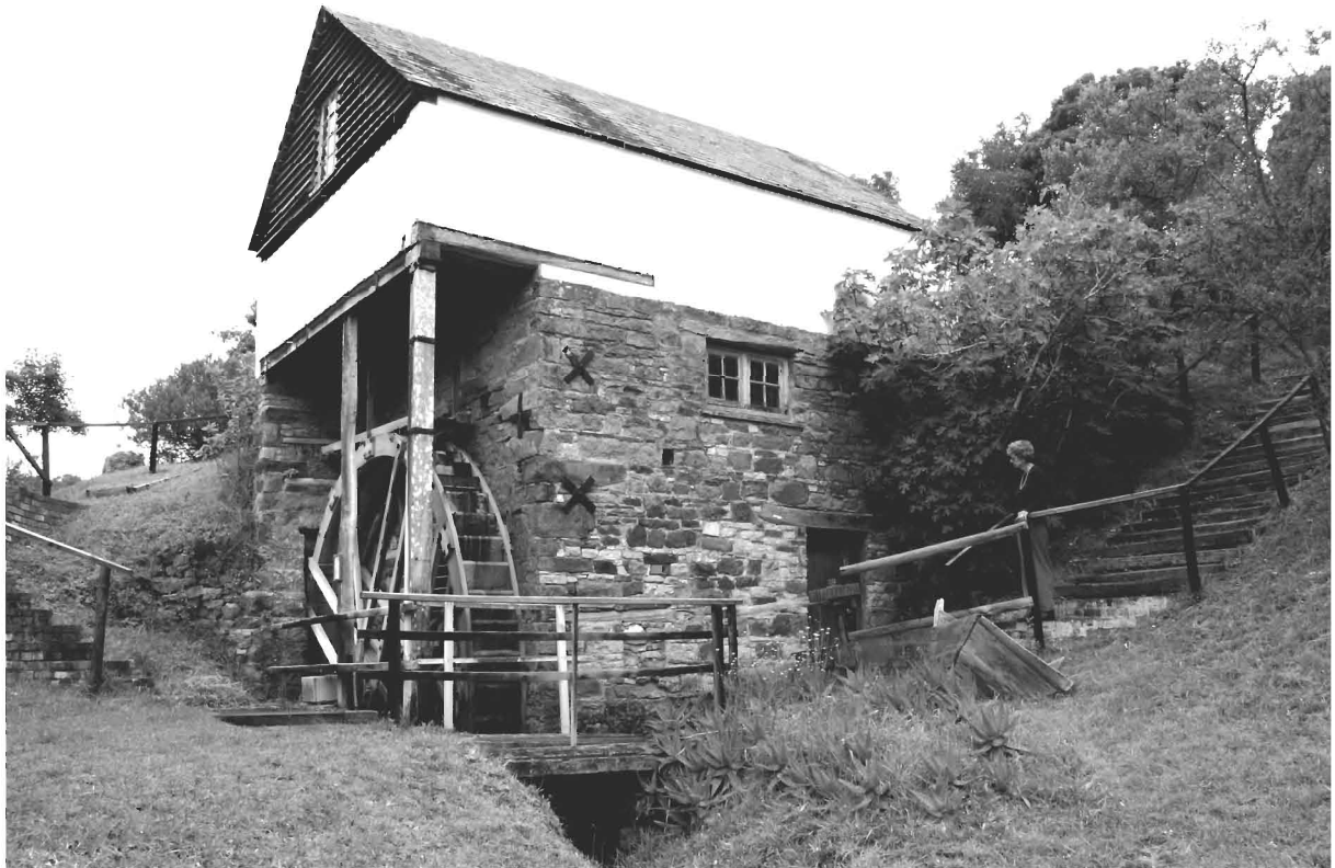
Figure 3. Bradshaw Mill, Bathurst, Eastern Cape, South Africa