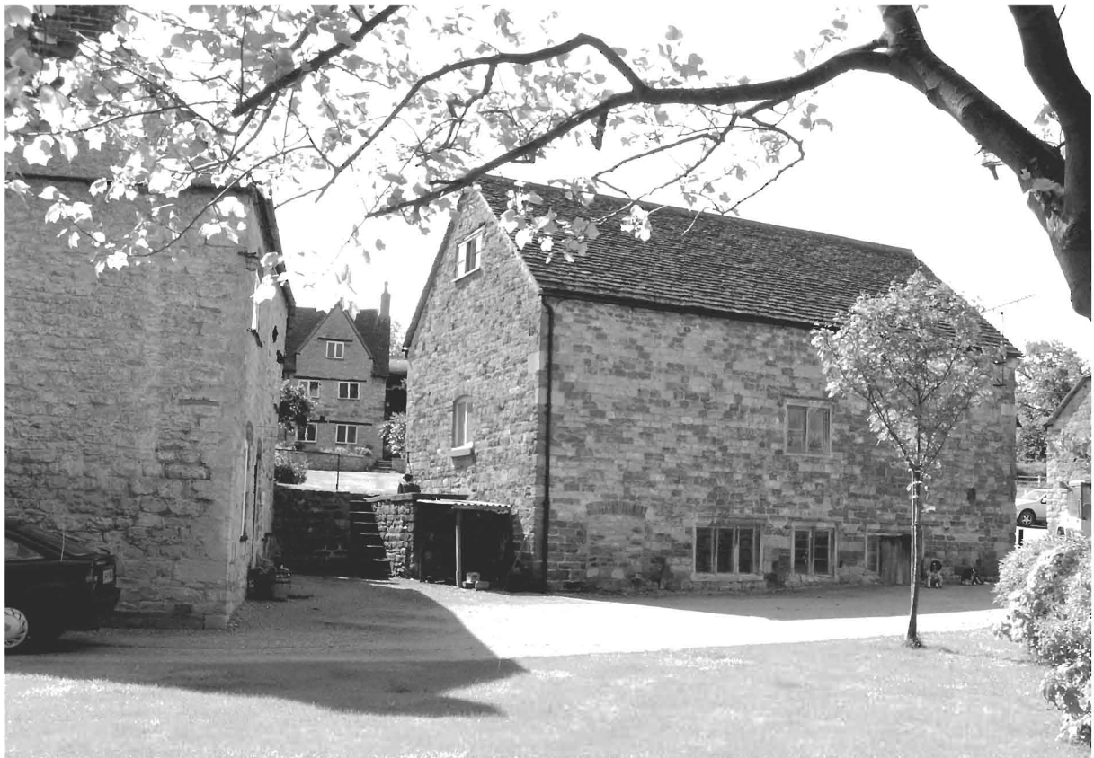
Figure 4. Dursley Mill, Mill Farm, Dursley, Gloucestershire