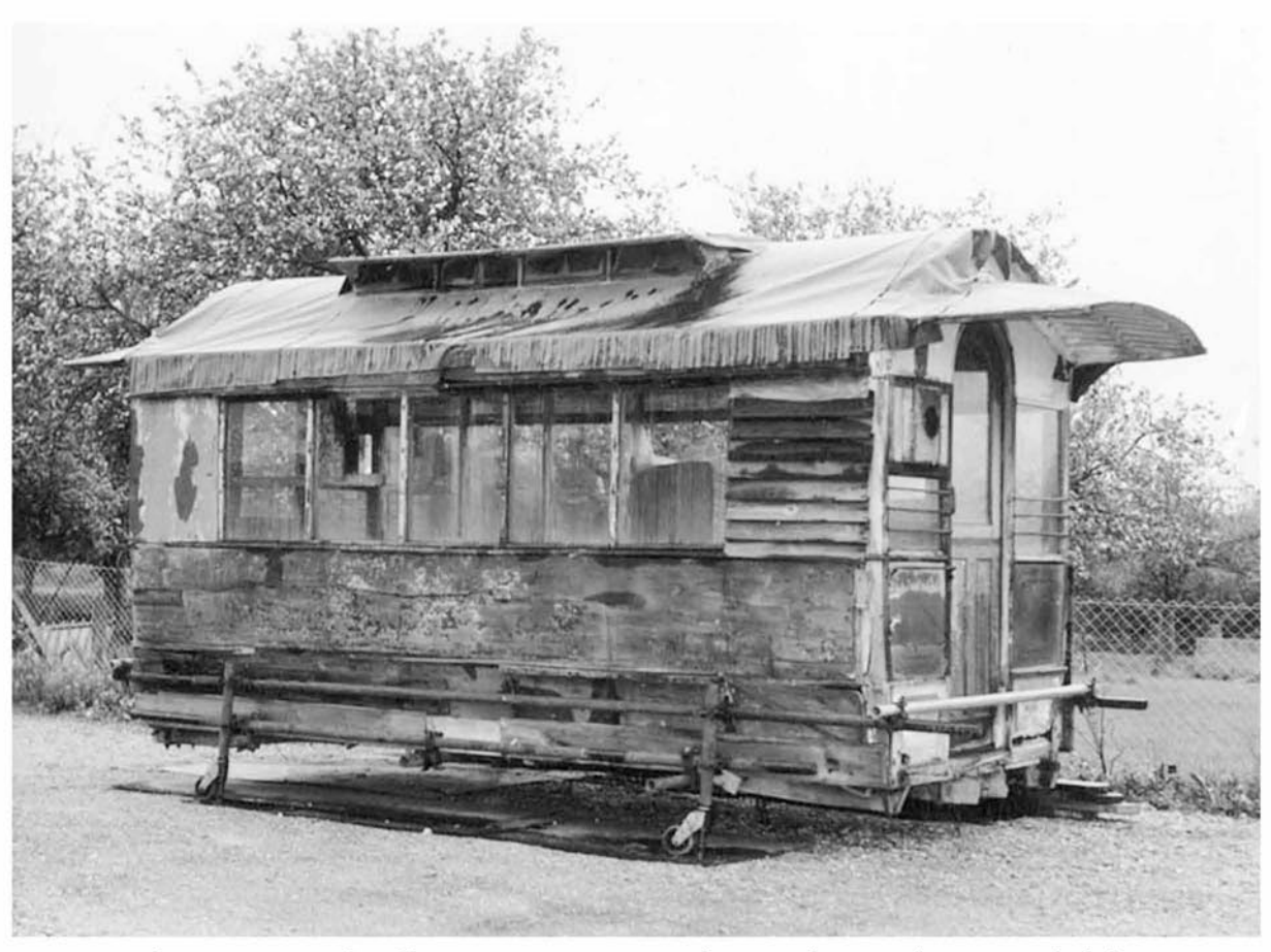
Figure 3. The Gloucester Horse Tram in 1966 in a garden at Hardwicke