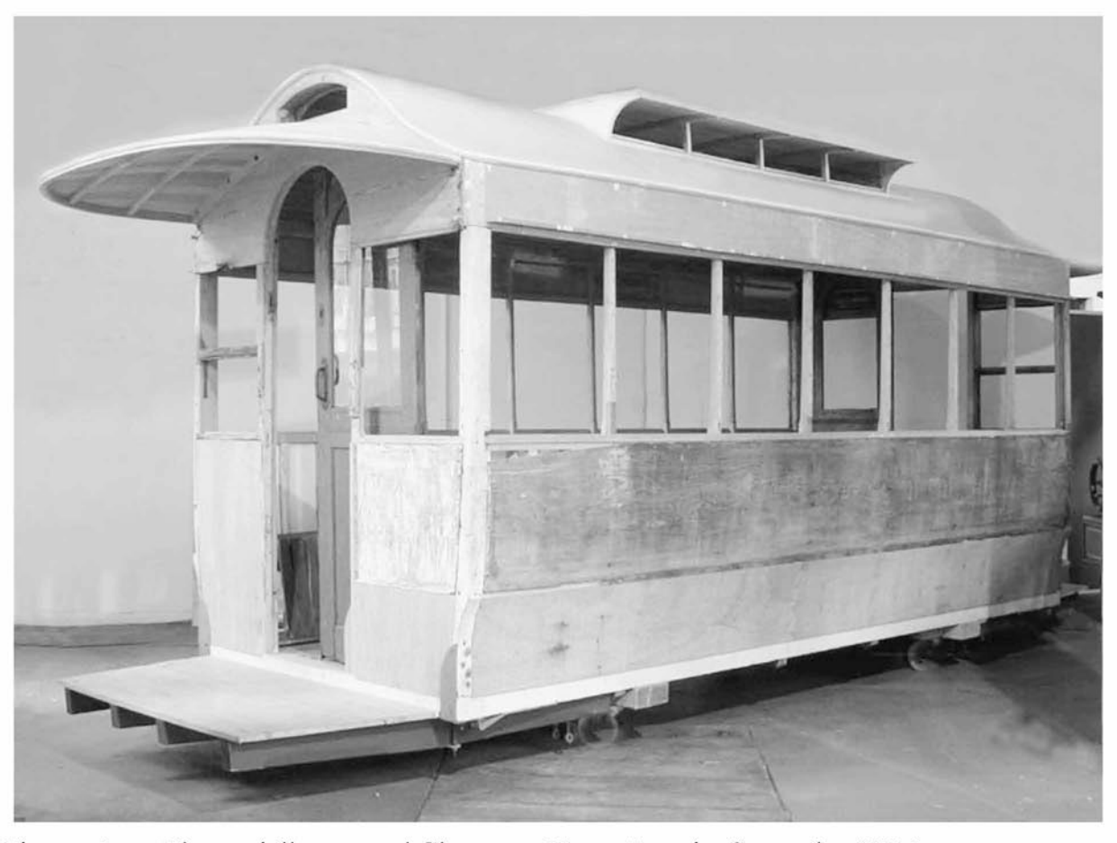
Figure 4. The partially restored Gloucester Horse Tram in September 2004