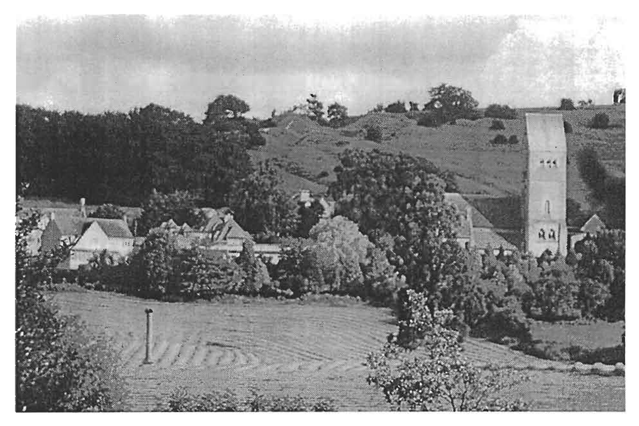
Column and Selsley Church (Looking East)