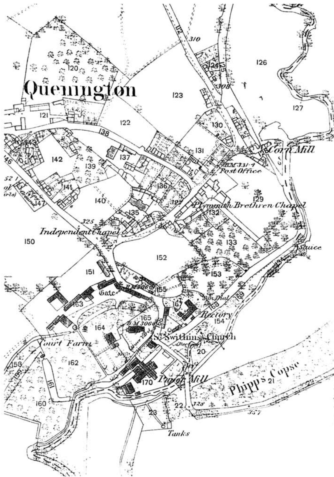
Figure 1 Quenington corn mill, shown on the first edition OS 1:2500 map. The leats to both the (upper) corn mill and the (lower) paper mill contrast clearly with the perambulations of the river.