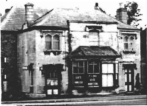
Front view from Westward Road