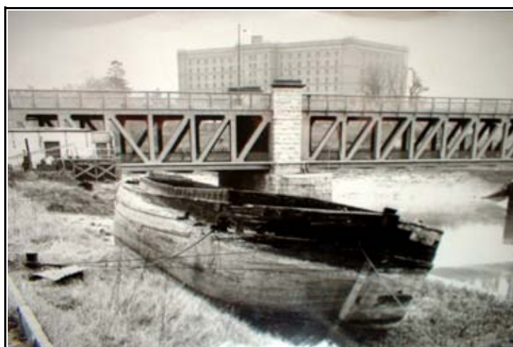
Plate 10 remains of the last trow Safety at Bristol