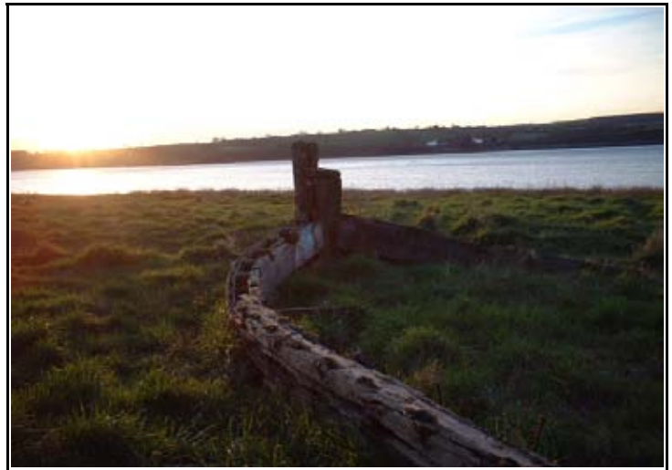
The setting of the