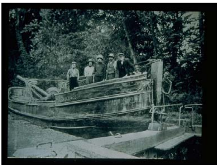
Plate 1 Reliance at Ryeford lock

Once a trow with external keel Did two trips weekly Newport to Stroud. Original stated as built at Cams-cross should be Cainscross