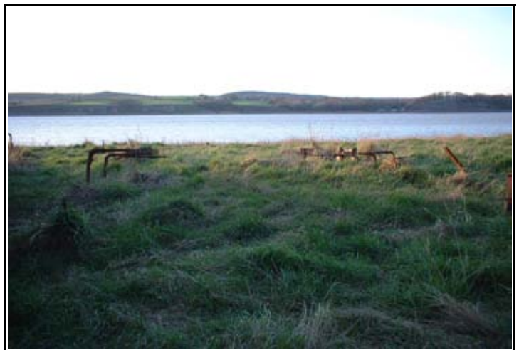
Plate 4 below Ada at Purton 16 th March 2004 (Author)

Dimensions L. 82.6 B. 18 D. 7.3 Tonnage ( ) G 81 N 67 Tonnage (1869) G 81.97 N 73.53 Tonnage (1870) G 81.97 N 81.97 crew space not allowed Tonnage (1881) G 81.97 N 73.53 crew space allowed Tonnage (1897) G 81.97 N 67