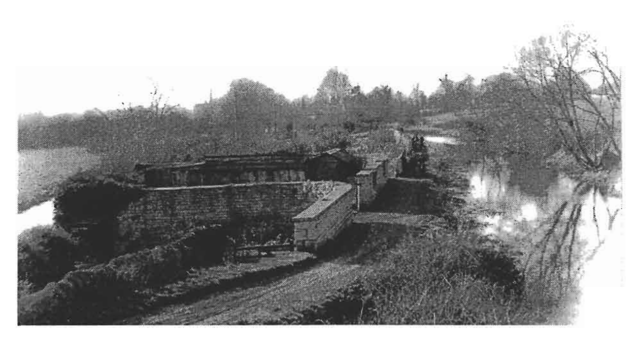
Figure 1 View of the Coal Pen Looking West Taken by Harry Townley in 1966