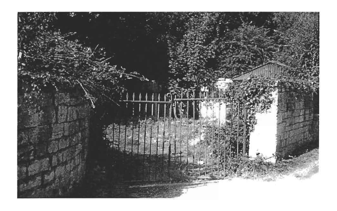
Figure 2 View of the Entrance to the Coal Pen in 2002, Looking South-west.