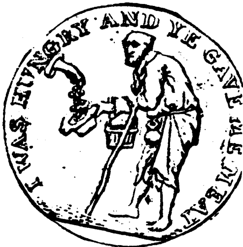
From a Trade Token

A happier note however is sounded by Rodborough Vestry in 1836, when the new Stroud Union Workhouse was being built up Stroud Hill. The Vestry refused to send the aged and destitute of their Parish to the new Workhouse saying they should NOT be separated from their relatives, and so would be kept on in the Parish poorhouse. And we may note that surgeons were annually appointed to attend to sick paupers in the poorhouse.