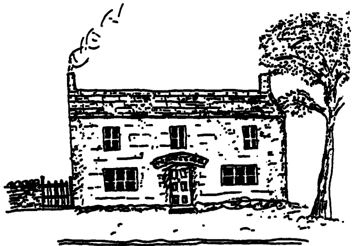
Albion House 1840

When my wife and I moved to Albion House in Coalway in the Forest of Dean three years ago, all we had been told about it was that it had been built in about 1840 and had been a pub. The architect who surveyed the house thought that part of the building dated from the 18th century, but the earliest date mentioned in the deeds was 1932.